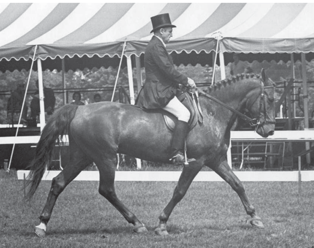
CLASSICAL STYLE: “Dr. Max” in an undated photo

Abridged from Dressage & CT , July 1994. Used by permission.